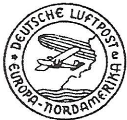
Confirmation stamp (BSt) in red

Distinctive letters: Berlin C2 = "a" and "b" Frankfurt/M. = "c" and "d" Lorch (Wuertt.) = "e" (up to 5.5.1936) Friedrichshafen = "e" (from 6.5. on) Stuttgart 9 = "f" and "g"