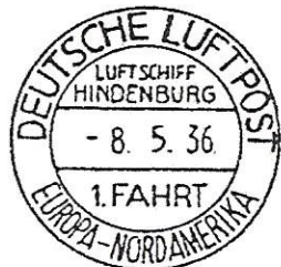
Board postmark (BPSt) in 2 types in black, seldom in violet and blue

Because of the large amount of mail, several post offices had to deal with the dispatch.