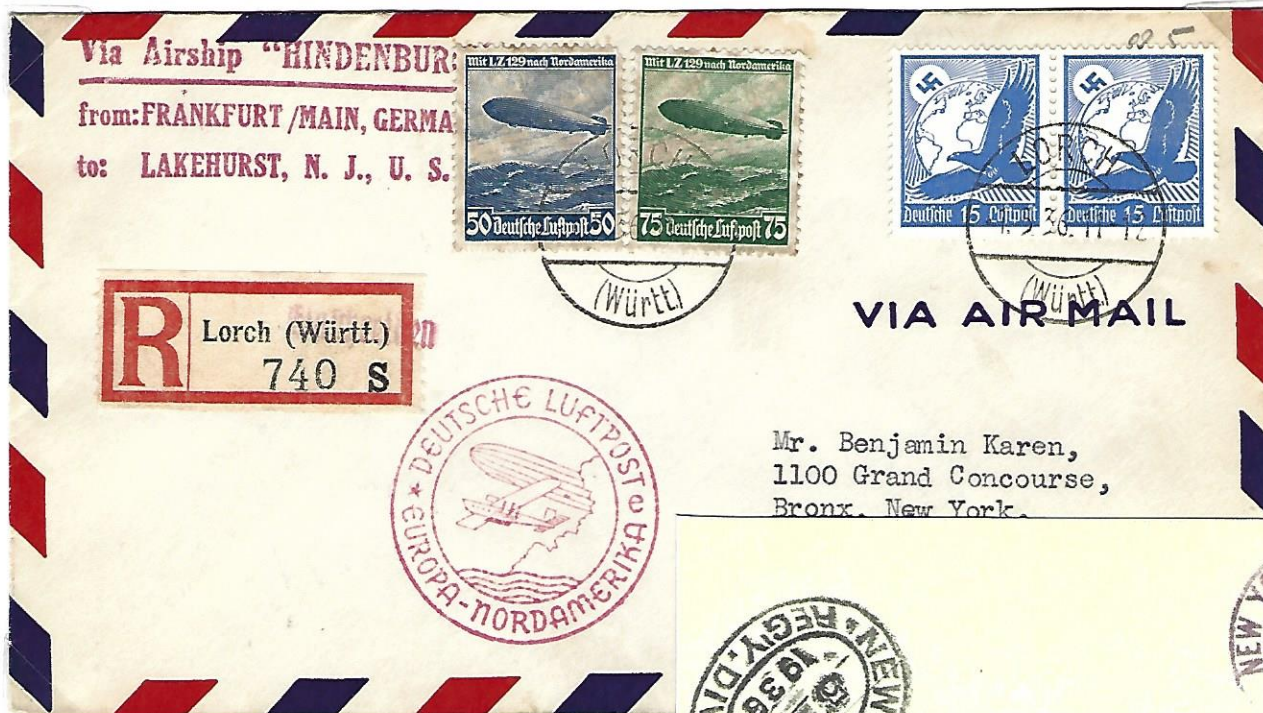
6.-14.5.1936 First North America Flight 1936

First North America Flight - May 6 to 14, 1936