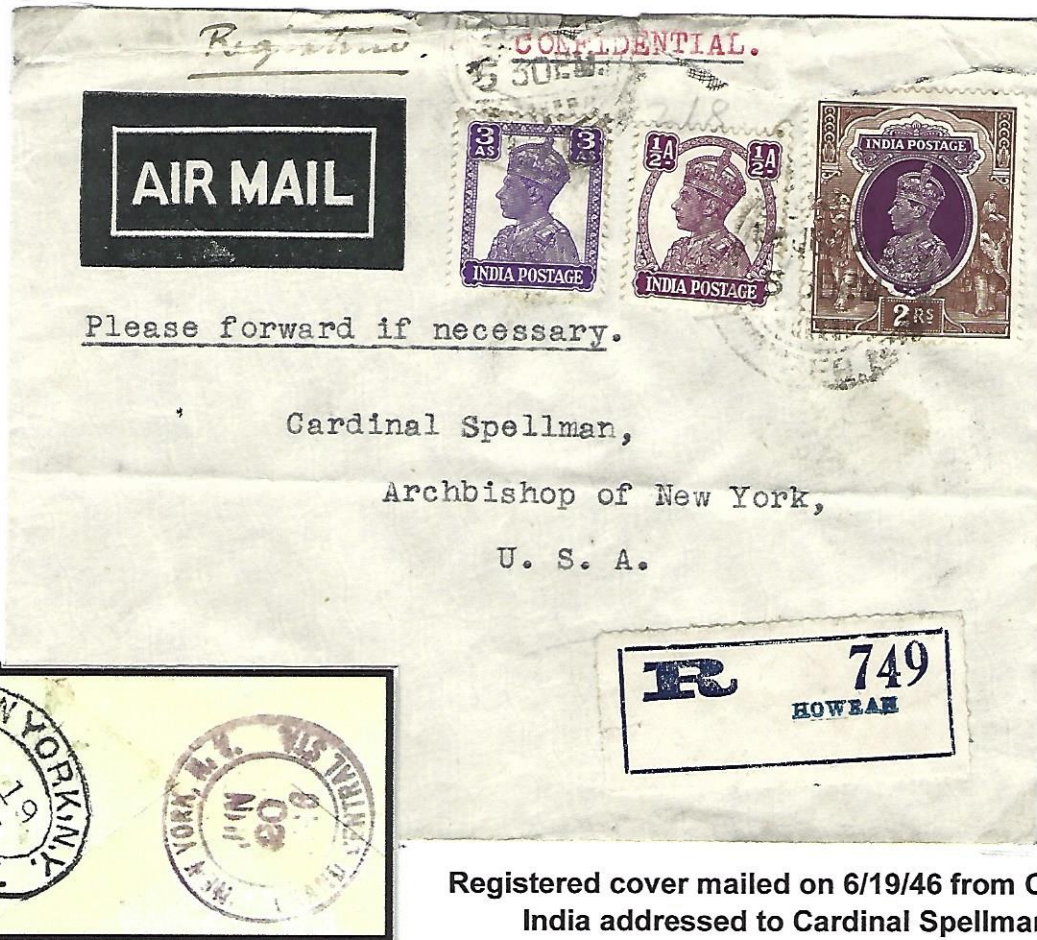
Registered cover mailed on 6/19/46 from Calcutta, India addressed to Cardinal Spellman.

The Cardinal Spellman Philatelic Museum was founded in 1960. The collections that make up the museum are the personal collection of Cardinal Francis Spellman, the collections from the Philadelphia National Philatelic Museum, and collections donated or loaned by other collectors. Its principal mission is to engage and teach diversity, history, and geography through its philatelic exhibits, library, resource center, and programs for children. The museum is located at 235 Wellesley Street, at Regis College, Weston, Massachusetts.